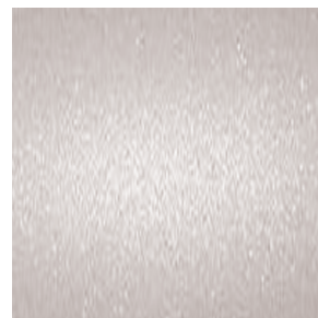
334 Sparkle Etched Glass