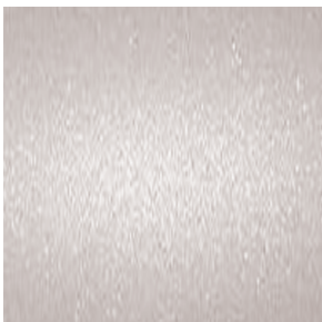
334 Sparkle Etched Glass